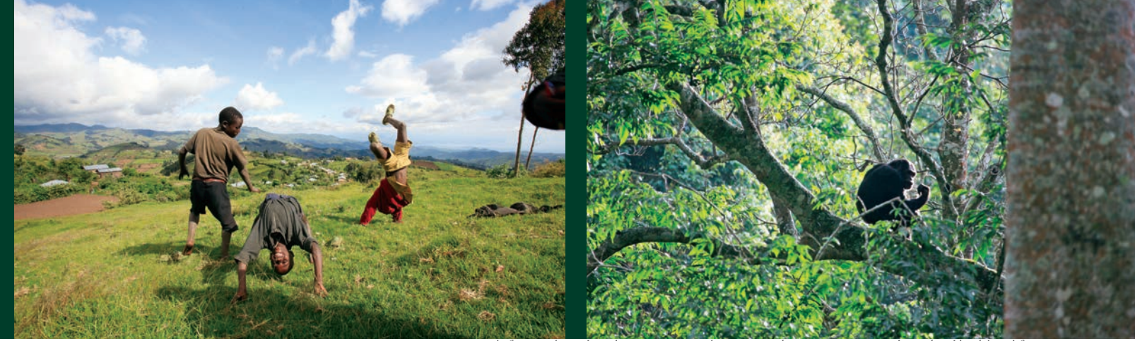
left. Displaced and growing populations pushing into once undisturbed highland forests, Gishwati Forest, Rwanda. right. Nyungwe Forest, monitoring wild chimpanzees, Rwanda

been a source of inspiration and purpose but also a huge responsibility. When I began to realize how important the developments I was witnessing were, I began to speak publically about it. This has led to hundreds of opportunities to speak to various audiences of all sorts from Britain's Royal Society, to elementary school children, to many universities and to the presidents of several countries. As well, the films are helping inform many about the potential of restoration. Gradually, a shift in perception is emerging all over the world; the principles outlined in this essay are being taken up by various institutions, organizations and individuals. The United Nations Framework Convention on Climate Change (UNFCCC) has begun to see the importance of restoration, as has the United Nations Convention on Biological Diversity (UNCBD) and the