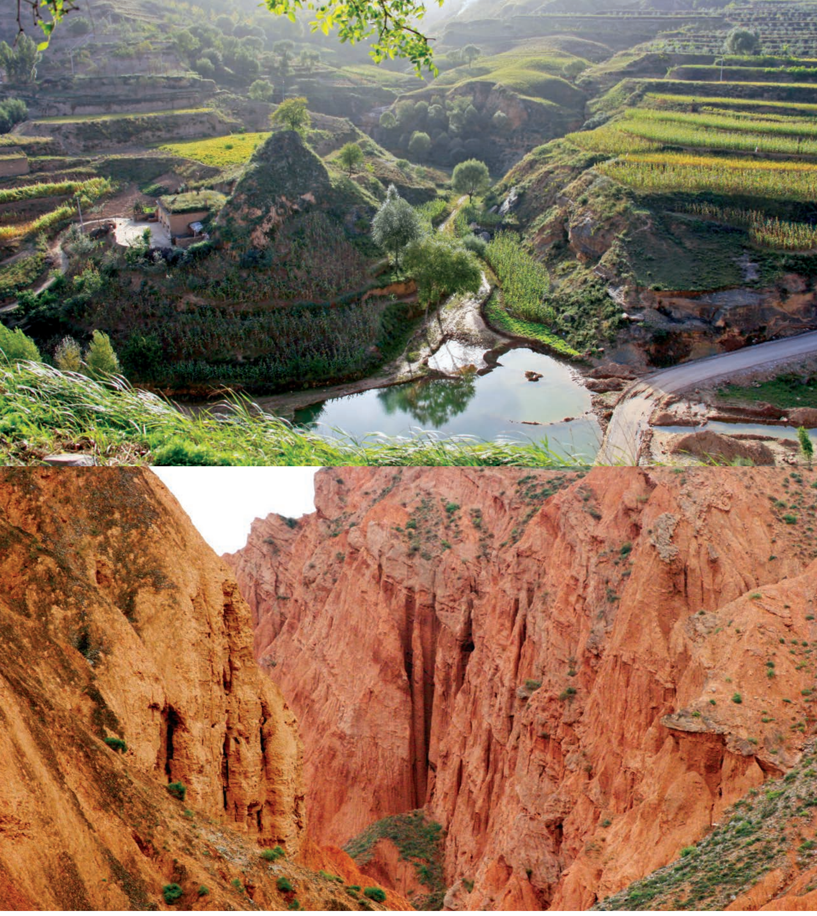
Before and After | Loess Plateau Watershed Rehabilitation Project

can be found on all continents. In these great primary forests epiphytes cling to every surface, making it seem that the trees have beards hanging from their limbs and fur on their bark. Even the rocks are covered in moss or mottled with lichens. The forest