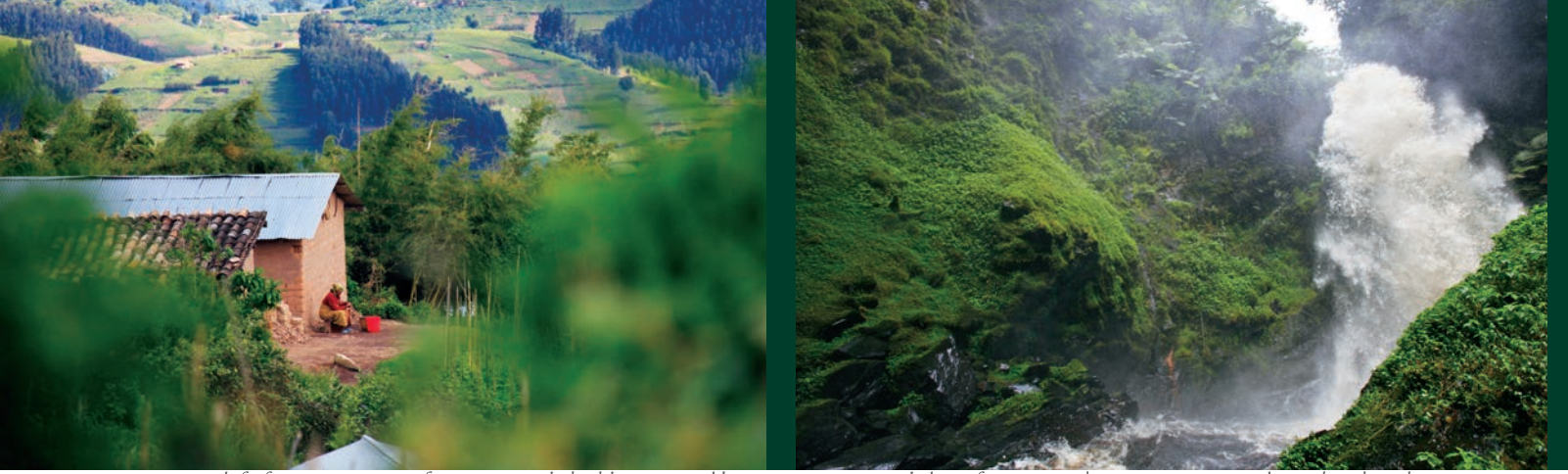
left. former intact rainforest, recently highly impacted by mountain top and slope farming, Gishwati Forest, Rwanda; right . The White Nile and Congo River Watershed, Functioning Highland Water Tower System, Nyungwe Rainforest Kamiranzovu, Isumo Waterfall, R wanda

but why. Geographical Information Systems (GIS) was also employed providing satellite images to map every watershed on the plateau. In this way a unique address could be assigned to even the smallest watercourse. Enterprise software that reflected every investment and every intervention was also used to track changes throughout the management chain.