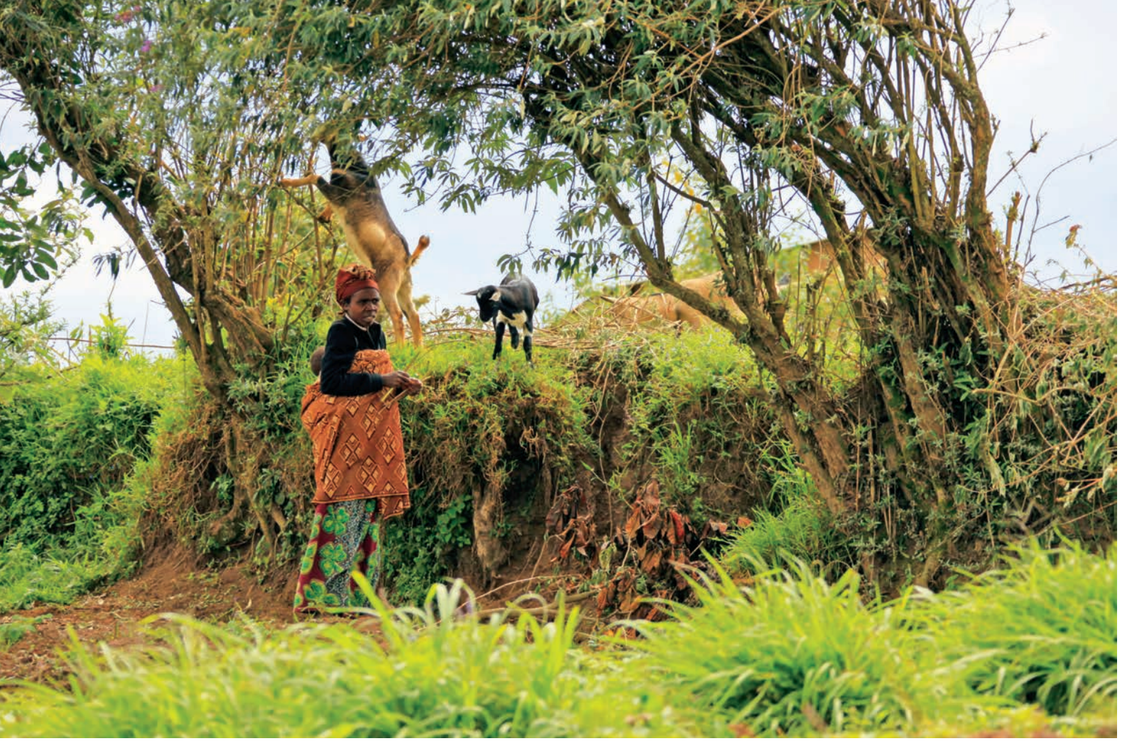
In Rwanda, where relatively recent ecological degradation from over-farming in the designated protected highland watersheds saw the near failure of the country's hydro-electricity supply, the government has undertaken a similar rehabilitation project to China's and experienced almost immediate improvements. Free ranging goats are, however, still a problem, Gishwati Forest, Rwanda

All the great civilizations include a great respect for the wisdom and contributions of those who have lived and died in the many generations that have gone before. Within the rise and fall of the great ancient civilizations on earth are profound lessons that our ancestors are sharing with us. The lessons of the Loess Plateau show that soil is not simply a medium for our agricultural crops to stand in, and that fertility is not simply nitrogen, phosphorous and potassium to stimulate growth. Organic matter is required to recycle nutrients from one generation of life to the next and microbiologic communities that live in organic soils are required not only to assist in recycling but also to release nutrients from geologic materials and to infiltrate and retain moisture. Understanding that these same organic soils are the second largest carbon sink on Earth after the oceans is to recognize their role in mitigating and adapting to human-induced climate changes and how they are of vital importance for our survival and sustainability.